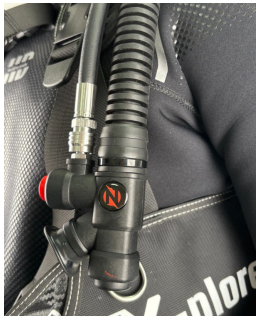
(Corrugated hose connected to the K-valve)