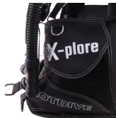
Trim-weight pocket system

Do not exceed the weight limit in the pockets, or you may damage the weight pockets. At a depth of 5 m / 15 ft, with a nearly empty cylinder and the BCD fully deflated, the amount of weight needed to reach neutral buoyancy is the maximum weight load your BCD should carry; do not load more than this. If you need help determining the correct weight to reach this condition, consult your dive instructor or dive shop. Incorrect weighting may cause insufficient lift during the dive, leading to serious injury or death. Make sure your weighting is appropriate. Being over-weighted means your BCD or drysuit needs more gas to control buoyancy during the dive, and that extra gas causes more inflation/deflation buoyancy-compensation problems as depth changes during ascent and descent. Too much weight may also make it hard to keep your head above water while upright at the surface. Too little weight may prevent you from descending and/or making a safe stop in a controlled manner. Before diving, test your appropriate weight configuration while wearing your complete set of equipment, first in a pool / shallow water or a safe, controlled environment. The lead in the trim-weight pockets cannot be ditched in an emergency. Use the trim-weight pockets only when, after the weights in the quick-release pockets or on the weight belt have been released in an emergency, the diver still has enough lift to maintain a safe ascent.