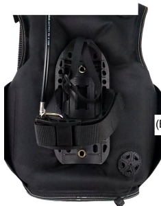
(Backplate: cylinder strap detail)

The BCD described in this manual is designed to carry a standard scuba cylinder with a maximum capacity of 12 L. See the illustrations for the connection method.